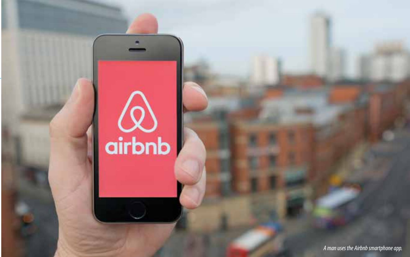
A man uses the Airbnb smartphone app.